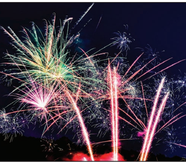
The entire Suches Fireworks Show was something to behold, especially the grand finale, expertly executed by the members of Suches Fire Station No. 5.

"We're from Dahlonega fireworks here until I did a Star-Spangled Banner," "Proud Suches Fire Department.