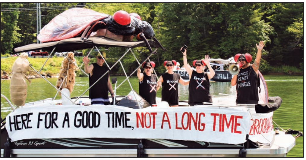
This cicada-themed boat won the Grand Prize in the 2021 Nottely Boat Parade, with members of the Brood X vessel promising to return in another 17 years.