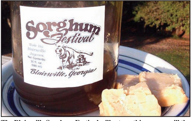
The Blairsville Sorghum Festival will return this year, as will the biscuit eating contest and other family-friendly competitions.