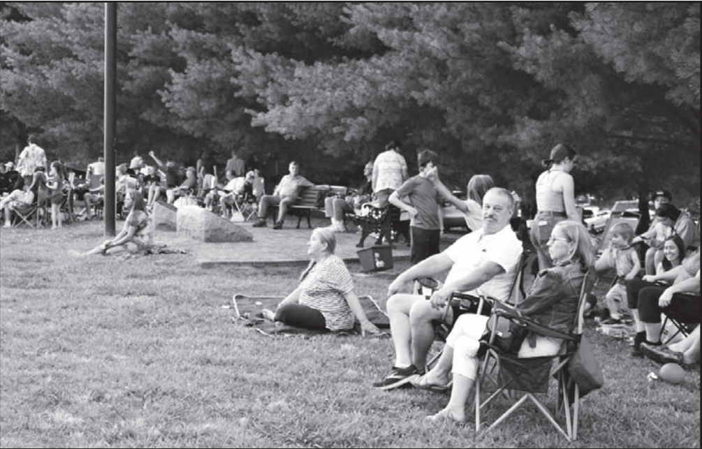
Many people celebrated the anniversary of America's independence from tyranny 245 years ago by posting up at various places for the Meeks Park Fireworks, pictured here behind the upper ballfields near the action.

America" before the barrage lasted about 45 minutes and spectators were pleased of fireworks began. The show started around 9:30 p.m., just as the sun set fully.